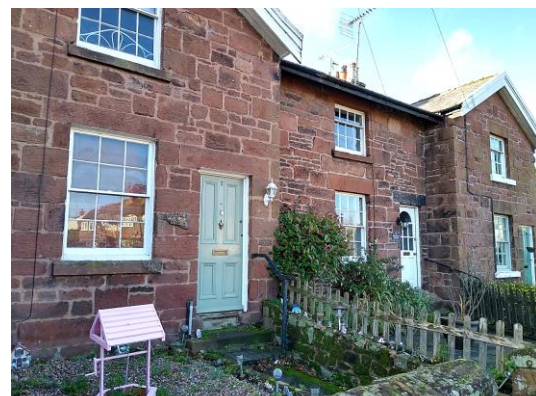
Lloyd's Cottages, Ness [November 2020]