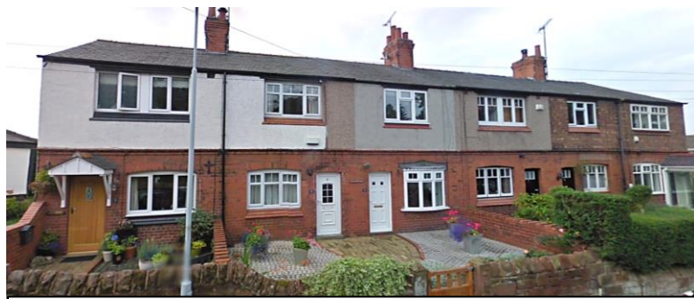
Mealor's Cottages, Well Lane, Ness