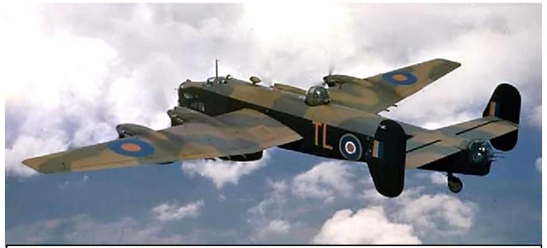
The Handley Page Halifax four-engined heavy bomber (this is not the Mark V version)

Lincolnshire on a night bombing exercise. The aircraft, which may have struck overhead power cables, came down near Thorne in West Yorkshire. He has not been located in the 1939 Register.