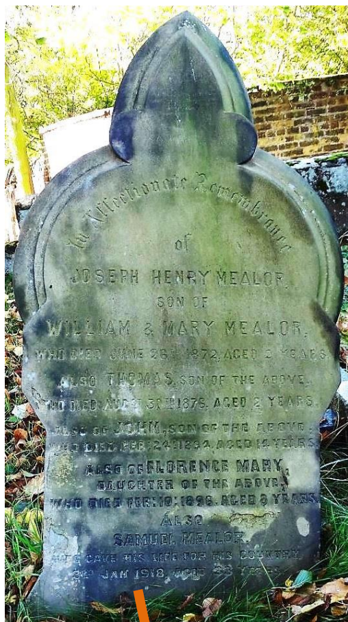
Mealor family gravestone, Neston Parish Church