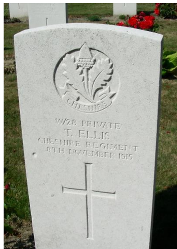
The War Grave of Thomas Ellis at Tancrez Farm Military Cemetery, Belgium.