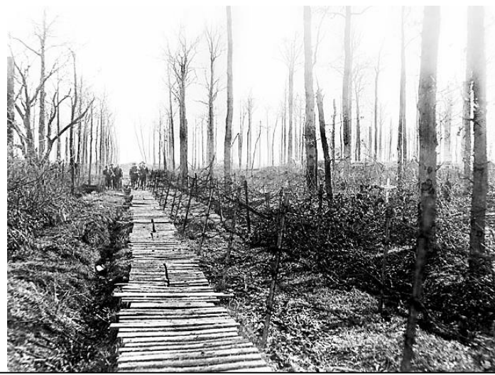
Hunter's Avenue, Ploegsteert Wood, 16 February 1918. By this date the path had become a well-used, duckboarded route.