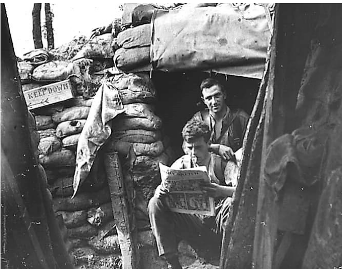
July/August 1916, Ploegsteert Wood near Messines.