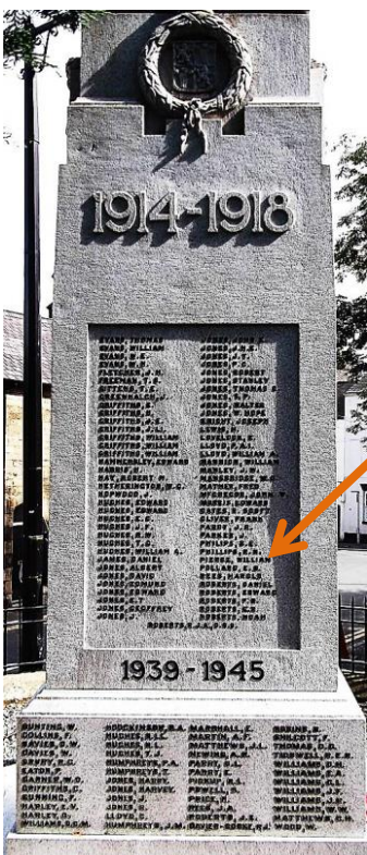
The Mold War Memorial