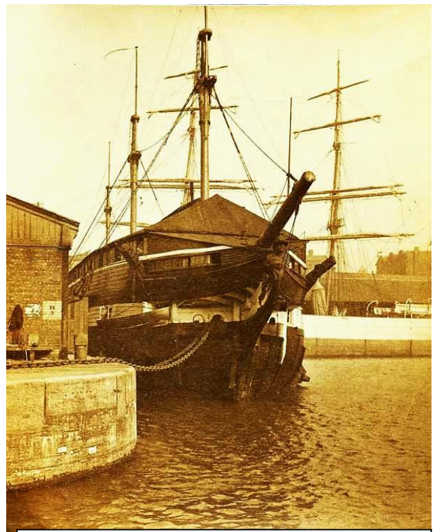
HMS Eagle in Brunswick Dock, Liverpool