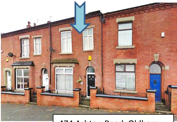
474 Ashton Road, Oldham