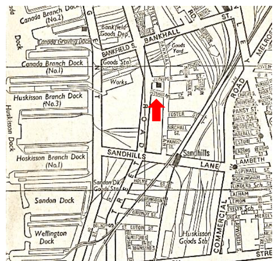
The location of Studholme Street (arrowed), off Derby Road [AtoZ Street Atlas of Liverpool]