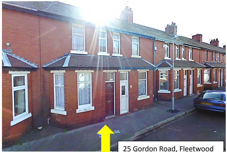
25 Gordon Road, Fleetwood