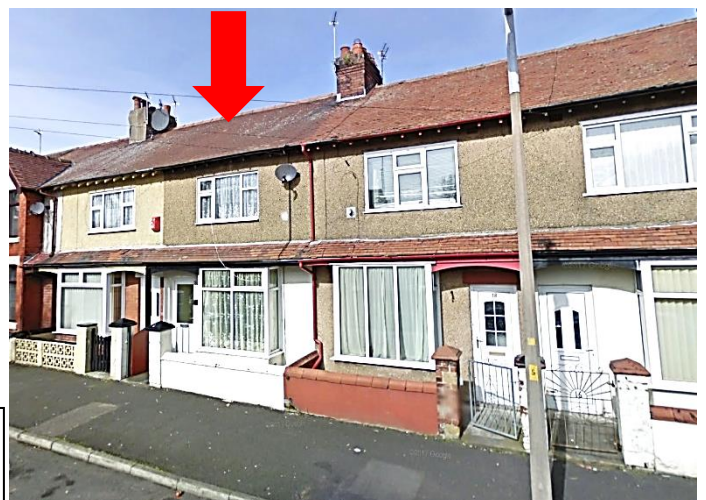
20 Percy Street, Fleetwood